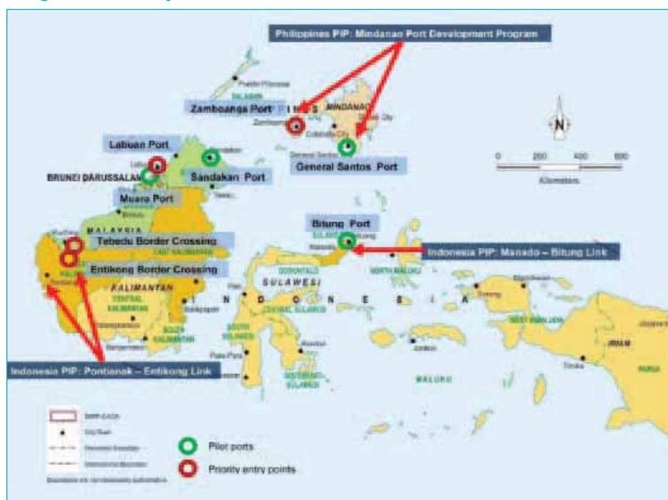
Figure 3 Priority Ports Covered Under BIMP-EAGA CIQS Harmonization

Under previous and ongoing assistance of the Asian Development Bank (ADB), various diagnostic assessments have been conducted at the eight priority entry points, including (i) a mapping of existing local CIQS RRP and practices; (ii) time release studies (TRS) to set baseline performance data as well as validate performance gaps; and (iii) private sector consultation to gather their perception of ongoing trade facilitation effectiveness. These inputs have been used in the formulation of the sector-, entry-point specific standard operating procedures (SOPs) to implement the CIQS MOU to make sure trade facilitation reforms and measures identified are consistent, practical, and relevant to each locality. The SOPs are products of a gap analysis-action planning-implementation and monitoring cycle, and will serve as the implementing guidelines for specific reforms to improve CIQS operations in these entry points.