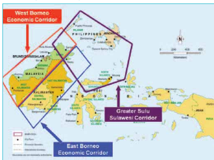
Figure 2 Priority Economic Corridors in BIMP-EAGA

To provide a more coherent spatial focus to BIMP-EAGA's connectivity strategy, the 4th BIMP-EAGA Summit in Singapore in November 2007 endorsed the development of economic corridors to better direct infrastructure investments to well-defined geographic spaces in the subregion. Economic corridors are geographically defined areas where synchronized and systematic development aims to facilitate the efficient cross-border movement of the factors of production; and stimulate trade, tourism, investment, and other economic activities. Infrastructure development is a prerequisite for an economic corridor to evolve, as it can help activate and accelerate cross-border activities; promote access to markets; reduce trade and transport costs; and facilitate growth between two or more production, export, or consumption points. The development of economic corridors in BIMP-EAGA is in line with the objectives of BIMP-EAGA's Roadmap to Development to promote physical and cross-border mobility. Economic corridor development would also enhance the subregion's competitiveness by linking production with supply chains, as well as the opportunities for small and medium-sized enterprises (SMEs). Two priority economic corridors were designated: the West Borneo Economic Corridor (WBEC) and the Greater Sulu Sulawesi Corridor (GSSC) (Figure 2). 1 It is significant to note that at its 4th Summit, BIMP-EAGA itself was declared as an economic corridor within ASEAN.